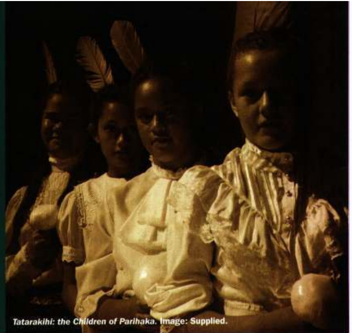
Tatarakihi: the Children of Parihaka .