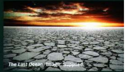
The Last Ocean

"I knew that if a doco was going to create awareness that I had to set up a trust and a foundation. We created The Last Ocean Project (see www.lastocean.co.nz ) and it's turned into a