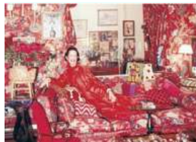
Diana Vreeland: The first fashion editor to recognise fashion photography as an art form.