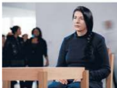
Ever present: Performance artist Marina Abramovic spent every minute of her three-month show interacting with patrons.

Building on the childhood fantasy of digging a hole in the earth to the other side of the planet, Russian documentarian Viktor Kossakovsky's beautiful-looking film brings together four antipodes. Dialogue-lite, its main aim is to showcase the juxtaposition of locations, the best of which is the pairing of Argentina's pastoral Entre Rios and China's bustling Shanghai. New Zealand's Castlepoint's appearance is brief.