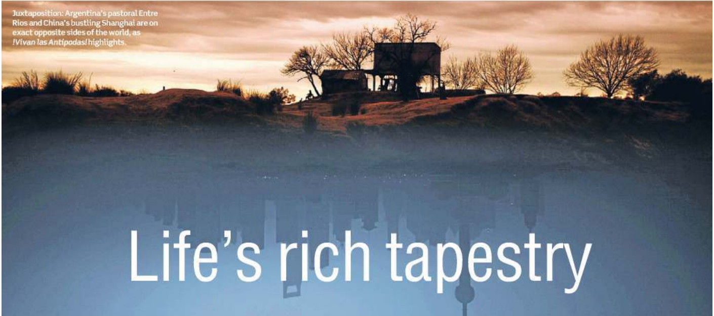
Juxtaposition: Argentina's pastoral Entre Rios and China's bustling Shanghai are on exact opposite sides of the world, as !Vivan las Antipodas! highlights.